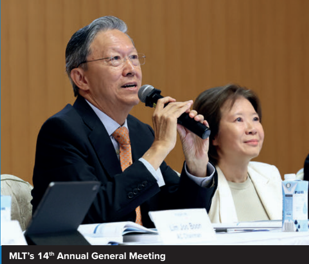
MLT's 14 th Annual General Meeting

The Manager of MLT is committed to fostering open and transparent communication with unitholders and the investment community. Through this proactive approach, we are able to provide investors with equitable, timely and accurate information related to our strategies, operations and performance. This empowers MLT unitholders with the knowledge to assess our business and make informed investment decisions.