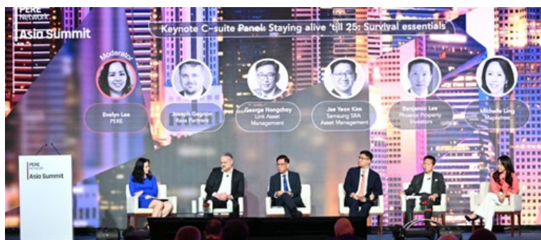
Mapletree participated in PERE Asia Summit 2024's panel discussion to further engage with the global real estate investment community.

The capital management business will continue to evolve as the Group develops innovative real estate investment products to cater to the varying needs and risk-return profiles of its investors. Mapletree is also exploring the launch of two private funds in the coming financial year, with a focus on Asian markets where Mapletree has well-established development expertise and on the ground capabilities.